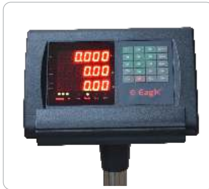
OPT 082 Counting Indicator