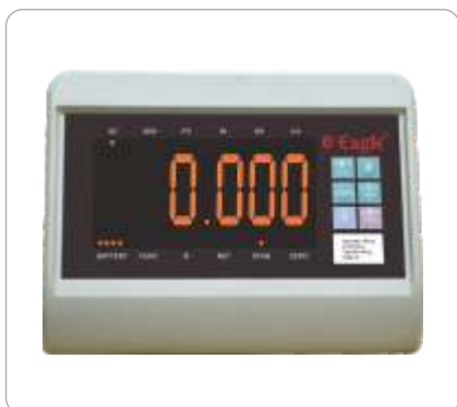
OPT 084 - EX - Industrial Indicator - 50 mm LED Display