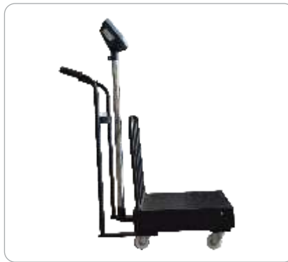
OPT 015 to 018 Trolley With Handle & 4 Multidirectional Nylon Wheel