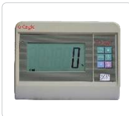
OPT 085 - EC - Industrial Indicator - 50 mm LCD Display