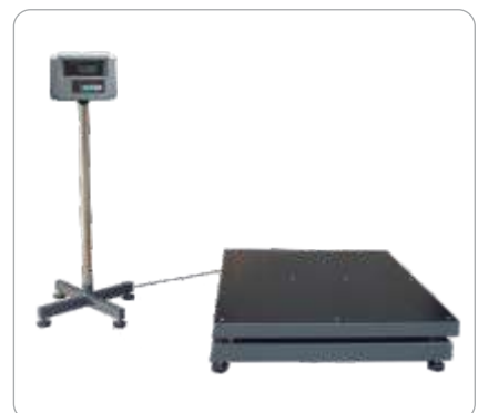
OPT 108 X Stand For Indicator Mounting