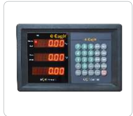
OPT 083 Price Computing Indicator