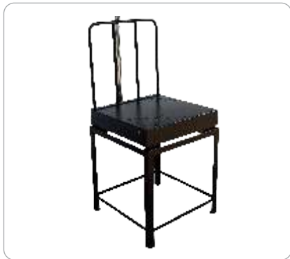
OPT 073 to 076 Stand Of Height 1000 mm