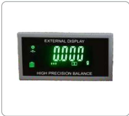
OPT 014 12.5 mm GREEN LED Remote Display